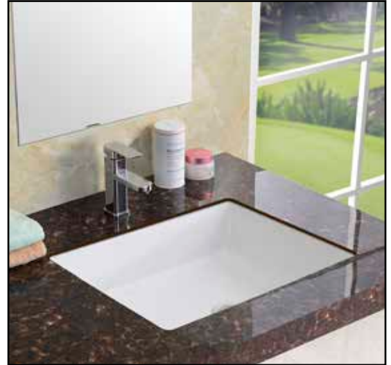
Installed Product Image

Please note: All porcelain sinks are fired at a very high temperature; final dimensions may vary slightly.