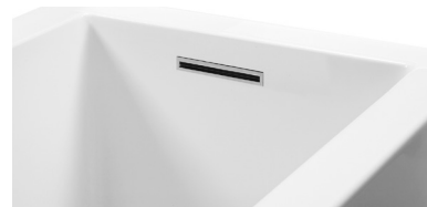
Optional Slim-Line overflow