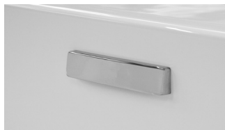
Rectangular overflow included

Slim-Line Overflow with Toe Tap Drain Solid Brass Drain Chrome (SLOTSBC) $930 Brushed Nickel (SLOTSBBN) $935 Polished Nickel (SLOTSBPN) $935 White (SLOTSBW) $965