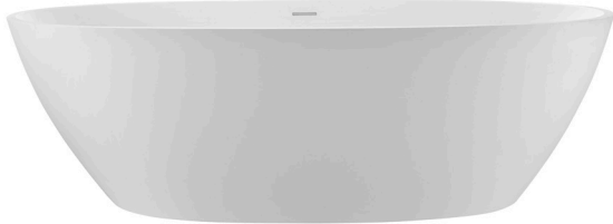
Shown above as soaking bath without pedestal