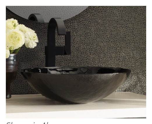
Shown in Abyss

MG1717-AS Abyss MG1717-BO Bianco MG1717-BR Beachcomber